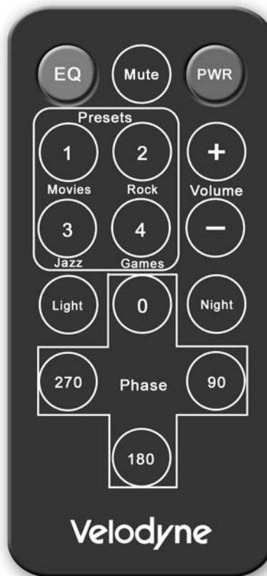
Figure 3. Remote Control

NOTE: The SPL-Ultra remote can be attached magnetically to the back of the subwoofer in the upper left hand corner.